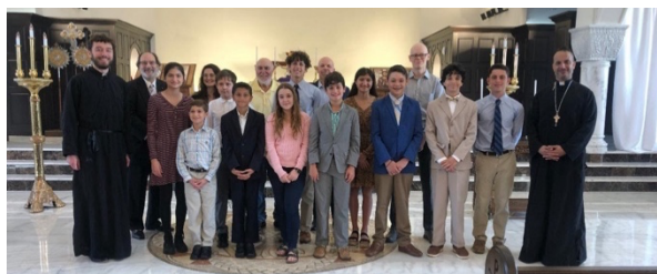
St. John Chrysostom Oratorical Festival competitors