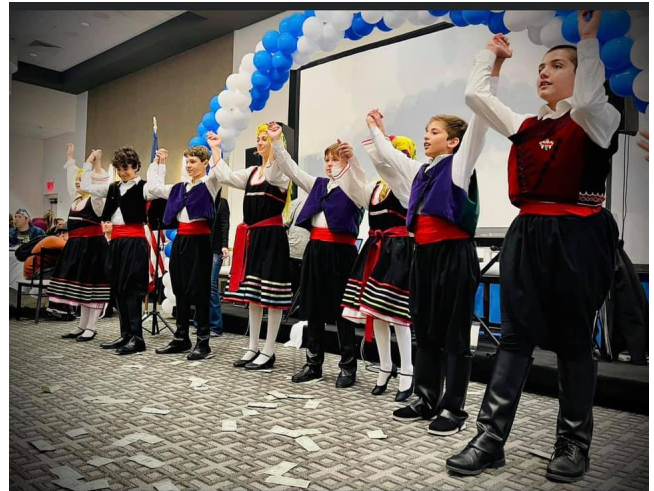
Performing at the 2021 Greek Festival

We are always in need of volunteers to help with costumes, special events, and fundraising.